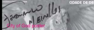
City of God poster